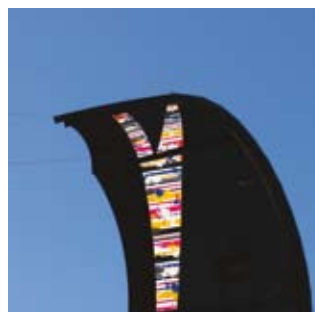
Low friction rings on bridle